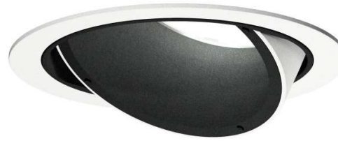
Black Décor Cowl as standard

The ECLIPSE 75 Downlight recessed adjustable brings all the features of the Eclipse spotlight into a recessed mounted compact modern downlight. Available in various exit lumens, various colour temperatures, colour rendering options and beam angles. Manufactured to exacting standards and available in White, Grey or Black as standard. Other colours and options to suit custom requirements are available, subject to order quantities.